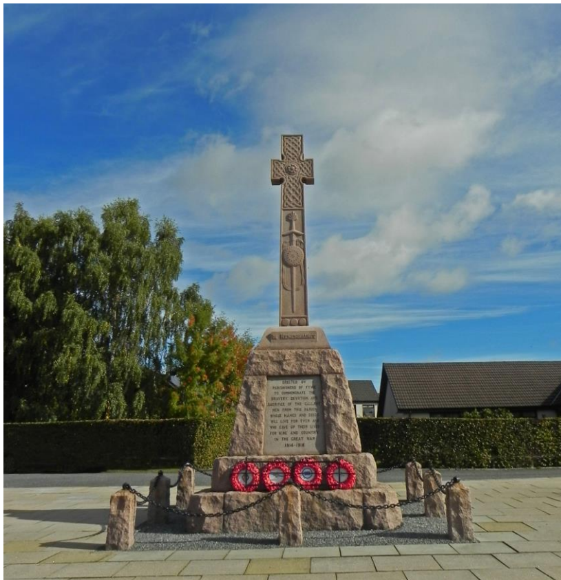
Fyvie War Memorial